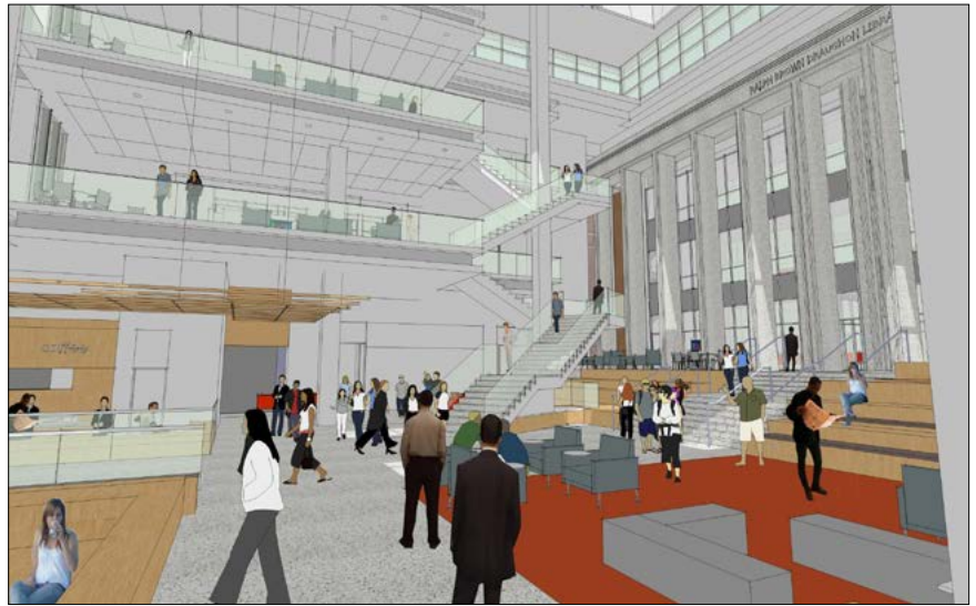
Artist's concept of the front of RBD Library as it will look from inside the Mell Classroom Building. (subject to change)

extent possible while working hard to maximize the many benefits this new design will bring once it is completed.